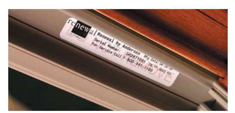
Our window manufacturing process labels each customer's window with its own identification number and our toll-free number. If service is ever needed, call our toll-free number or your local Renewal by Andersen showroom.