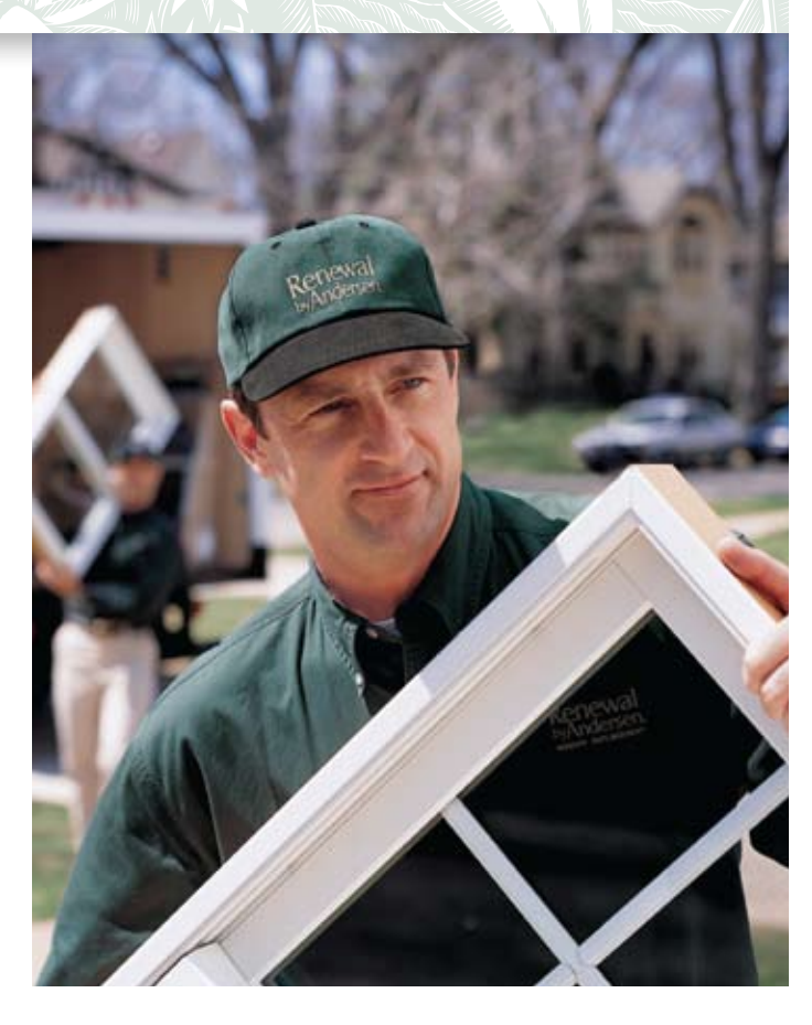
"Renewal by Andersen" and all other marks where denoted are trademarks o Andersen Corporation. © 2008 Andersen Corporation. All rights reserved. Rev. 11/08

For more than 100 years, Andersen Corporation has been committed to product excellence, customer satisfaction, environmental stewardship, and corporate citizenship. Renewal by Andersen follows in this tradition and brings these values into every home we serve.